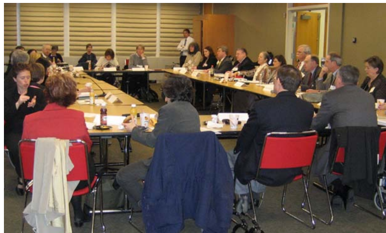
Summit on Healthcare Access for People with Disabilities

With the passage of the ADA in 1990, we expected big changes in short measure. In some areas the changes have been fairly dramatic--such as in public buildings, communication and transportation services.