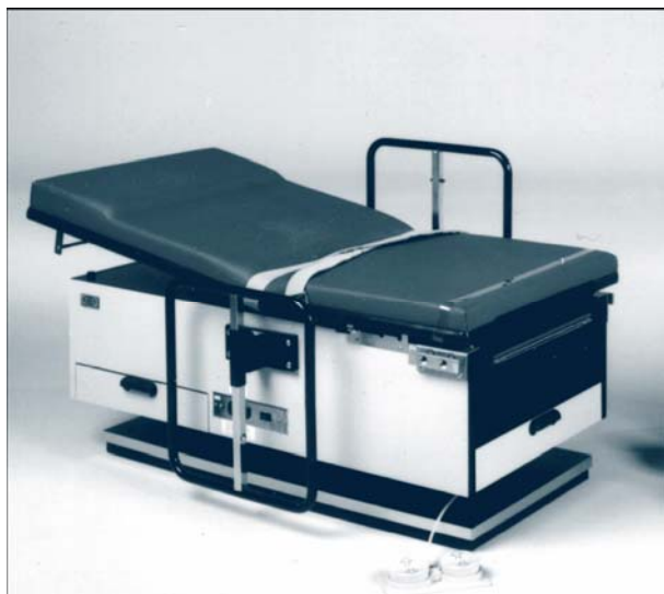
An adjustable exam table which lowers to wheelchair seat height, making transfers easier and safer for both the patient and the medical staff. Picture not copyrighted.

When it comes to identifying the range of subtle and overt health care barriers people with disabilities face daily, ranging from insurance disincentives and provider misconceptions to the impact of the scarcity of sign language interpreters, accessible scripting and accessible exam tables, scales, and screening technologies, there are few, if any, accounts that tackle the spectrum with the depth and scope of Part II of this book.