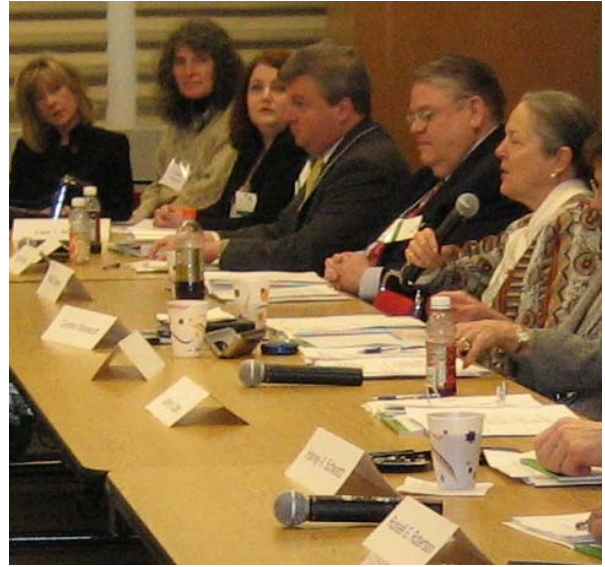
Health Care Access Summit participants

We hope you find this issue of our newsletter informative. We welcome your comments and feedback!